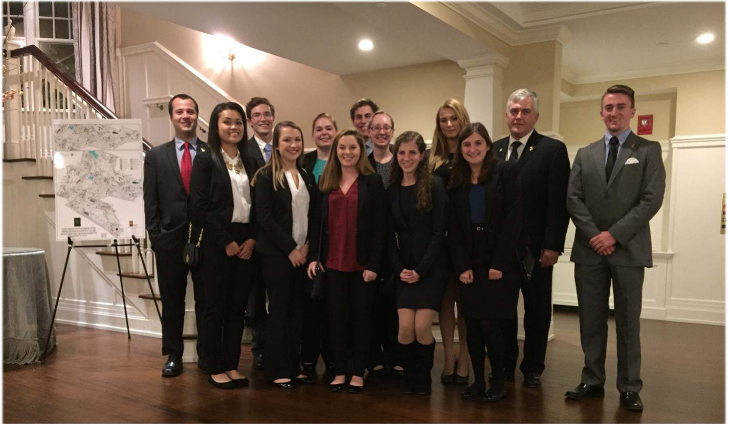
2016-2017 UMass CMAA Student Chapter at Brae Burn Country Club in Massachusetts for NECMA Annual Meeting.

Type/Position: Professor and Faculty Advisor to UMass Student Chapter of CMAA and to HTM Career Day Brief Description of Experience: Professor of Club Management, CMAA Faculty Intern, NECMA and CMAA Member Ideal Situation: Graduate about 15-20 students per year with club experience; involve and network students in club management placement. Teach HTM Club Management and HTM Global Hospitality Leadership courses.